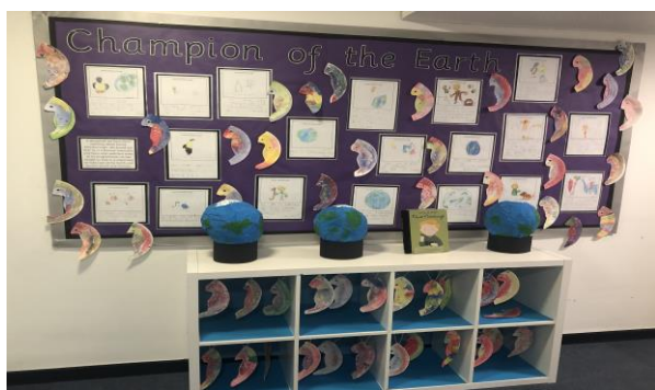
David Attenborough by Reception