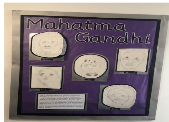
Mahatma Gandhi by Year 3