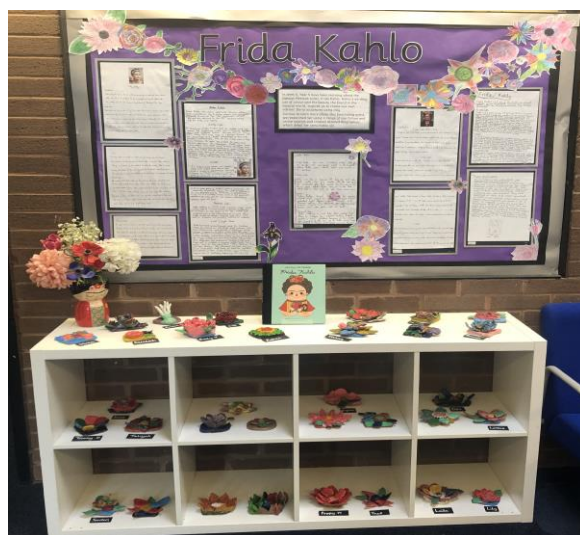
Frida Kahlo by Year 5