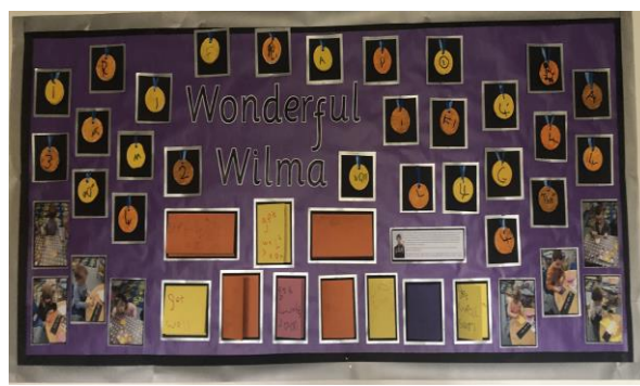
Wilma Rudolph by Nursery