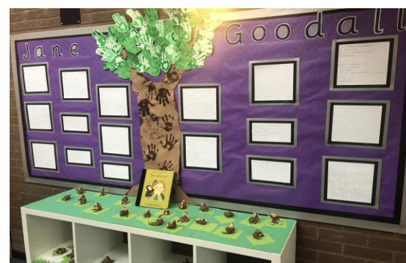
Jane Goodall by Year 1