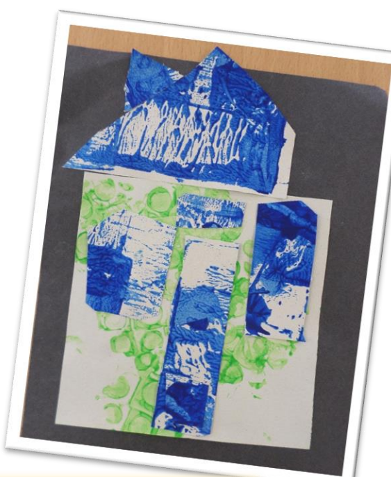
We are looking forward to lots more learning and fun in Term 2! Have a lovely half term everyone!