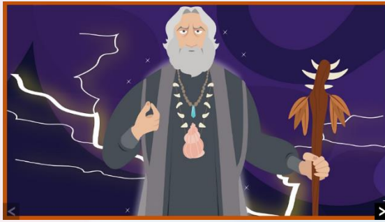
Prospero in the 'BBC Teach' animated version of 'The Tempest'.