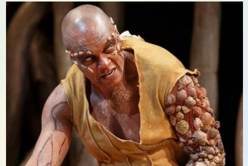
An actor playing Caliban in a stage performance of 'The Tempest'.

Anyway, that's just the beginning of the story! You'll have to find a copy of the book to find out what happens next – but it's exciting stuff – and features a horrible monster called Caliban who is also Prospero's slave, but plans to get rid of Prospero, marry his daughter and become king of the island himself!