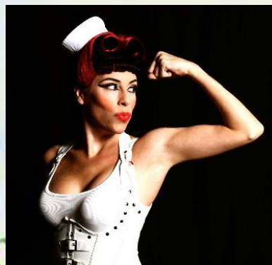
Audrey Luna – amazing opera singer!

As I said before, I didn't know anything about this opera until I researched it – but there's some amazing music in it. But the thing that I thought was the most incredible was the singer who plays the part of Prospero's slave fairy – Ariel. The singer's name is Audrey Luna and she's astonishing! I've never heard opera singing like it. She sounds completely crazy and sings some amazingly high-pitch notes! Even though the words of the opera (the libretto ) are in English, it's often almost impossible to understand what